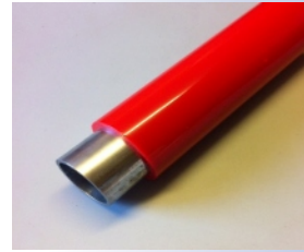
4 mm (4,000 microns) thick PVC over galvanised steel tube