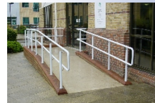
Typical Stargard ramp balustrade