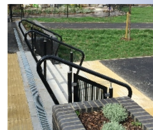
Stargard external balustrade

SG System Products Limited 22 Wharfedale Road Ipswich IP1 4JP Tel: 01473 240055 Fax: 01473 461616 Email: sales@sgsystems.co.uk