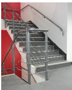
Stargard with stainless steel “Running rails”