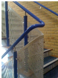
Stargard with perforated sheet infill panels